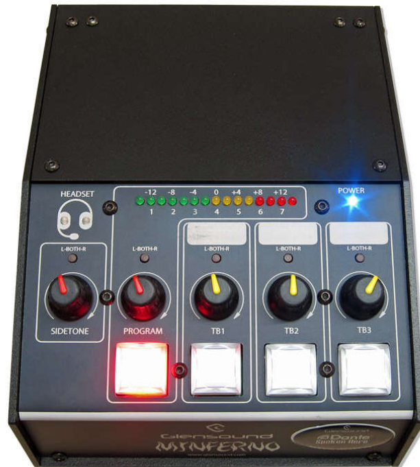
MinFerno/3 Commentator's Box