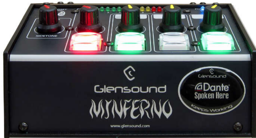
MinFerno/3 Commentator's Box